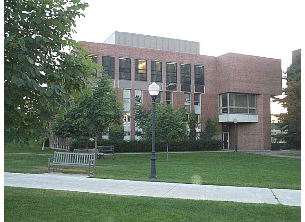
Dartmouth Biomedical Libraries