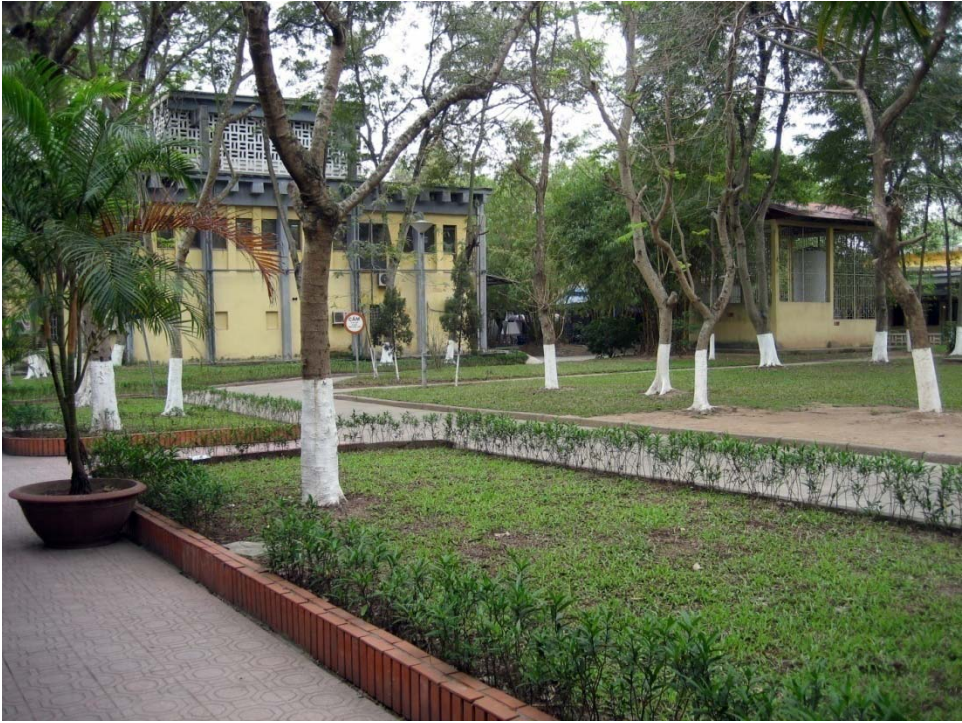
National Hospital of Pediatrics